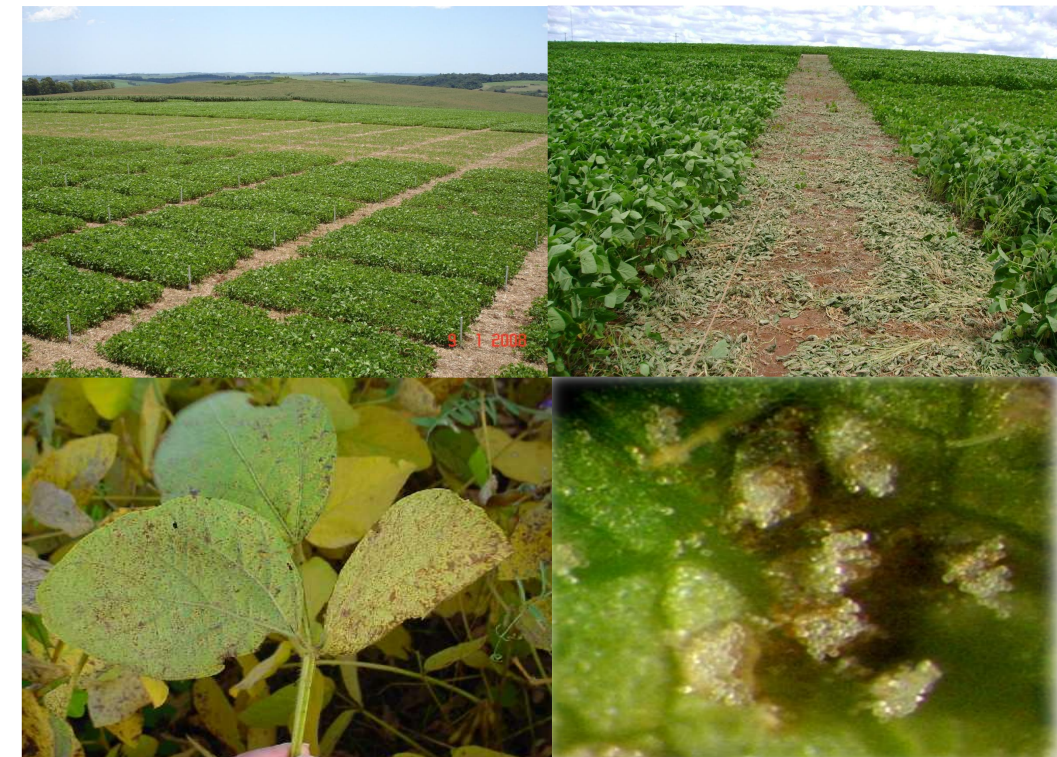
Figure 1. Picture taken from the experiment, 2007